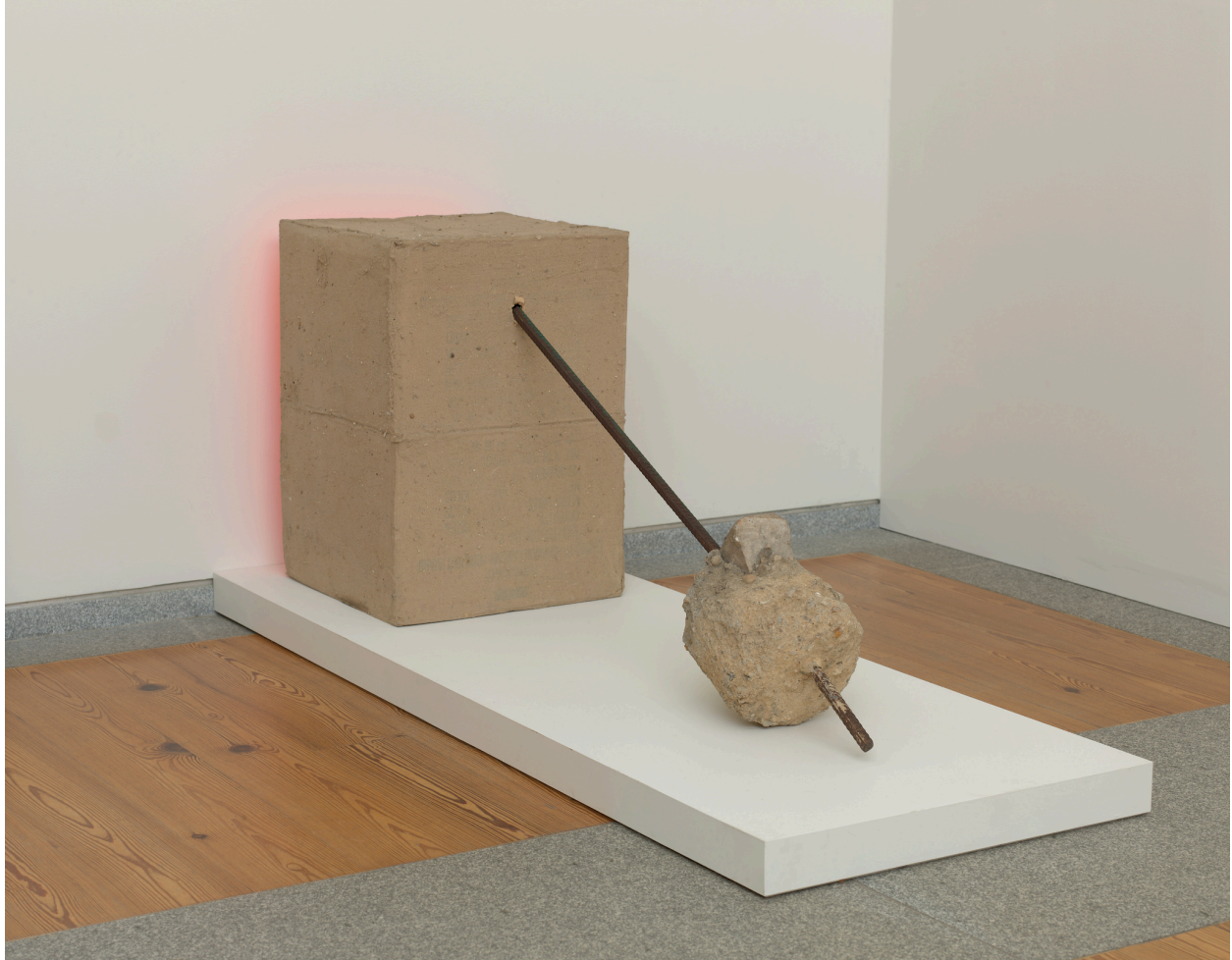
Figure 2: Robert Rauschenberg, Untitled (Early Egyptian) (1973).

The next step in the creation of this meta-object can be seen in Piper's Food for the Spirit . In this piece, Piper creates a dialogue with Kant's discussion of perception by objectifying herself as the subject of her own work. 16 This presents a conceptual framework for a discussion of the objectification of the Other, just as Piper had done earlier with works such as Catalysis (1970). In her words: "I experimented with my own objecthood, transforming it sculpturally as I