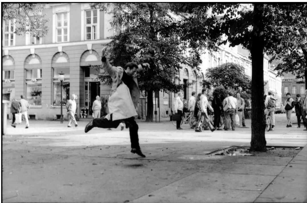
Figure 3: David Rokeby, Very Nervous System (1993 Potsdam installation view).

As digital technology advanced, artists began using metacreativity as a tool to create the meta-object, using the act of self-reference not with themselves, but with the system. One artist who employs this practice is David Rokeby. In his Very Nervous System (1986-2000), he utilizes cameras, computers, synthesizers, and an image processor to create sound based on the movement of one's body in space.